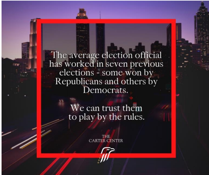
Figure 5. The Center's most popular social media card

After the presidential election, with Trump refusing to concede and the Jan. 5, 2021, Senate runoff elections looming in Georgia, The Carter Center shifted most project efforts toward violence mitigation in the state. In particular, the Center was concerned about the rising tide of threats being levied against activists, election workers, churches, and elected officials. In