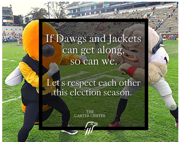
Figure 4. Social media "card" developed by the Carter Center