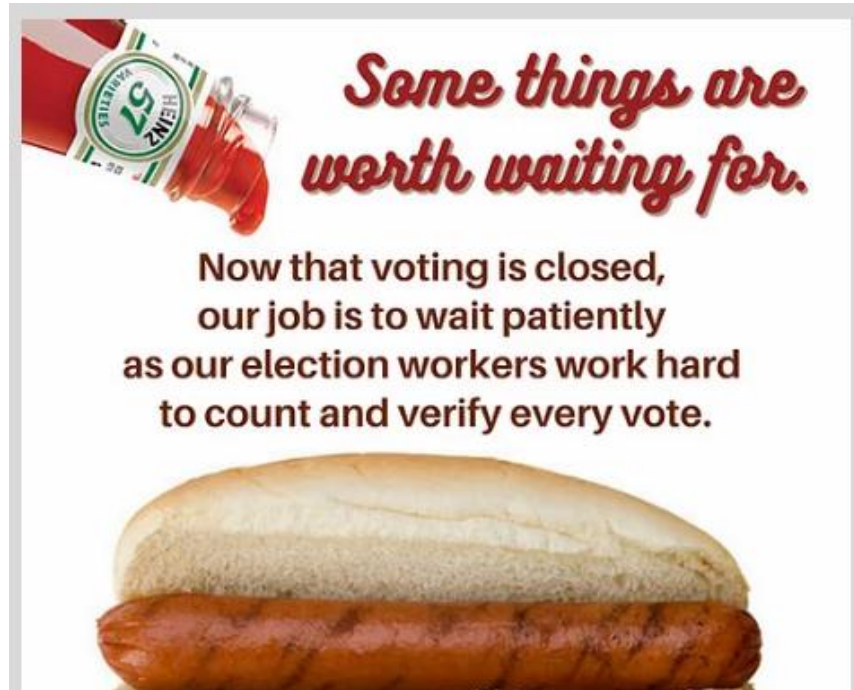
Figure 3 – An example of the social media content developed and disseminated by interfaith leaders in Pittsburgh. Pittsburgh is home to the H.J. Heinz Company.

In Atlanta, Center personnel conducted a rapid series of consultations, engaging a range of local nonprofits, faith leaders, and activist groups. In the weeks before the presidential election, the Center did not bring together a critical mass of local stakeholders focused on political violence prevention. This was, in part, because Atlanta and Georgia were already highly organized by left-of-center community-focused organizations whose time was almost entirely focused on getting out the vote. Instead, the Center organized a high-profile event with the King Center and the Georgia Secretary of State designed to reinforce anti-violence norms and bolster voter confidence. The Secretary of State used the occasion to reiterate basic rules and procedures for